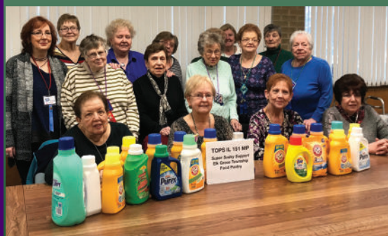
Members of TOPS chapter 151 Mount Prospect with their donation of paper goods and laundry soap.