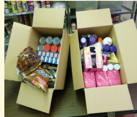
Feed the Children donation of 200 boxes of food and personal hygiene essentials via generous sharing of the Village of Mount Prospect.