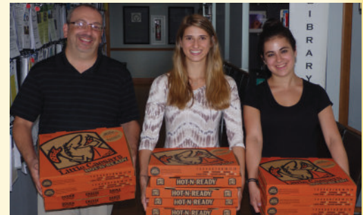
Little Caesars's of Elk Grove Village continues to be a reliable donor and a favorite among the families we serve. To date, they have generously donated over 1,000 pizzas!