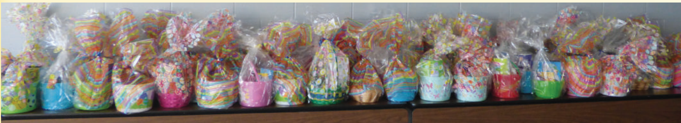
In April, St. Julian Eymard Catholic Church of Elk Grove Village donate beautiful spring Baskets to brighten the day of the children we serve.